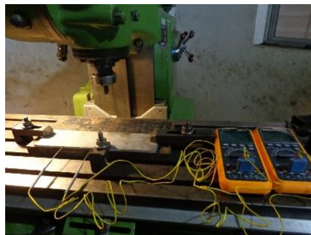
Fig. 2 Vertical Milling Machine

The plates were welded in single pass, normal to the rolling direction, with square-butt joint configuration employing vertical milling machine (Make: G. DufourMontrenil) shown in fig 1.2.