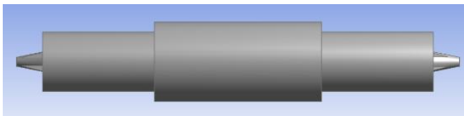
Fig 3 Design of tool.

All the nine experiment perform using newly design tool shown in fig. 1.2. This tool design by combining the features of square and tapered cylindrical tool pin profile